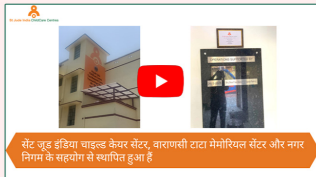
सेंट जूड इंडिया चाइल्ड केयर सेंटर, वाराणसी टाटा मेमोरियल सेंटर और नगर निगम के सहयोग से स्थापित हुआ है

With the opening of the new centre, St. Jude now has 38 Centres supporting over 480 families in Mumbai, Kolkata, Hyderabad, Jaipur, Vellore, Guwahati, Chennai, Delhi, and Varanasi.